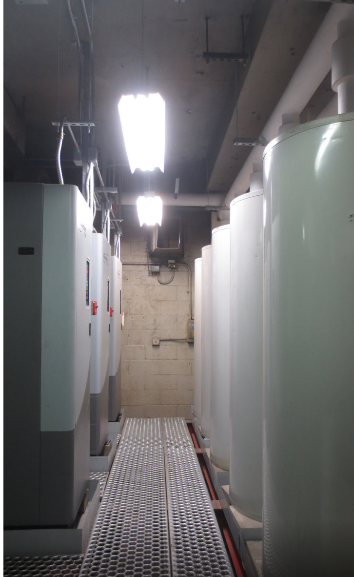
MAKING THE TRANSITION TO ALL-ELECTRIC BUILDINGS | 2

The past 5 years has seen multiple jurisdictions implement gas moratoria, forcing designers to move to all-electric buildings, while others have established carbon emission regulations such as <u>New York City's Local Law 97</u>, all-electric building codes, or <u>building performance</u> <u>standards</u> (BPS) that either require or strongly encourage all-electric construction. This trend is likely to intensify as more jurisdictions recognize the importance of decarbonizing buildings as part of a climate action plan.