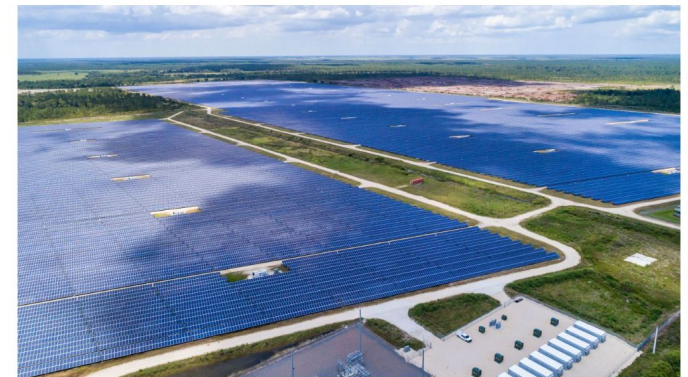
The Babcock Ranch solar array, which is run by Florida Power and Light.